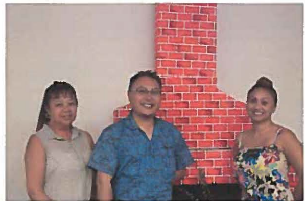
Region 9 – Regional Program Managers