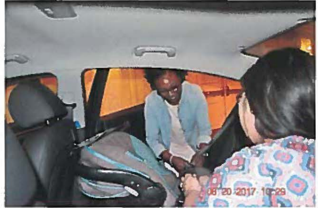
CPST NEW TECHNICIANS