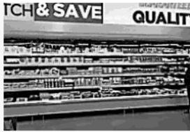
See what ALDI is doing to... Business Insider