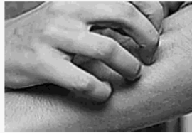
Psoriatic Arthritis... Yahoo Search