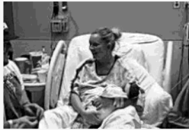
He Hands His Girlfriend... Tip Hero