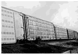
How a visit to a car... Washington Post