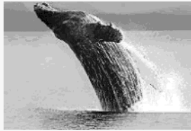
Why An Alaskan Cruise Is... Silversea