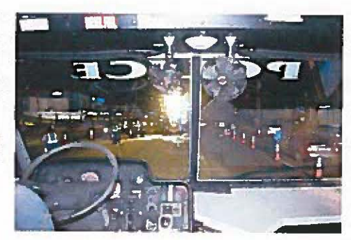
Statistics: (The information below reflects the total statistics from local law enforcement agencies.)