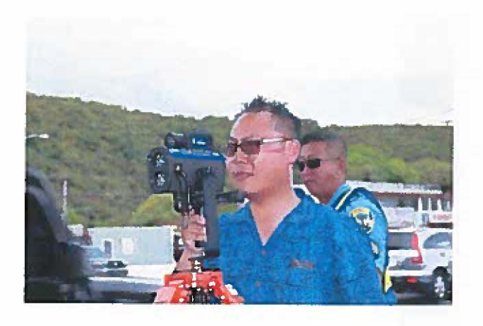
NHTSA-Region 9 Regional Program Managers Observing the GPD-HPD Speed Enforcement