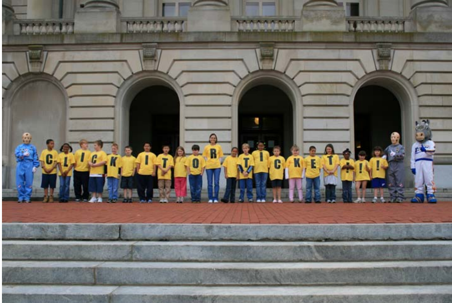
Frankfort Elementary School children display the “Click it or Ticket” slogan outside the Capitol following a press conference to mark the beginning of the campaign. The Kentucky Speedway’s mascot was also on hand for the announcement of the “Click it For Tickets” promotion.

A mini-sample set of observational surveys taken before the start of the campaign showed a baseline seat belt usage rate of 74.6%. A survey at the same set of sites taken during the enforcement phase of the “Click it or Ticket” campaign showed an increase to 75.7%. Once the intensified enforcement period was over, however, the rate dropped to 73.3% in the full 2008 statewide survey, which was completed between June and August.