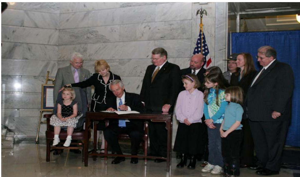
Governor Beshear signs the Booster Seat bill into law at a ceremony in the Capitol rotunda in April 2008.

The state legislature strengthened Kentucky's child restraint law in 2008 by approving a bill to require booster seats for children between 40 and 50 inches in height who are under the age of seven years. The law took effect in July 2008, but included a requirement that only courtesy warnings could be issued to violators until 2009. Even after this date, the law requires that courtesy warnings be issued for a first violation of the booster seat requirement. The penalty for offense was established at $30 with no court costs. In lieu of paying the fine, offenders may opt to purchase a booster seat. Kentucky's new law regarding the use of booster seats was a step in the right direction, but it does not meet NHTSA's criteria for incentive funding, nor does it cover as many children as state child safety advocates would like.