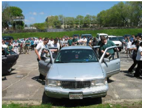
Matignon High students conduct Quick Click Buckle Up safety belt relay challenge

High schools across the state conducted traffic safety initiatives aimed at increasing teen safety belt use. Efforts included safety belt pledge drives, buckle-up relays, school-based assemblies, presentations and programs.